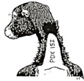
Center tail tattoo (CT) - CT: PDX 15Z Note: CT must be noted on the Registration form