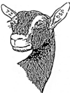
Tattoos are switched. Herd letters in left ear, number and year letter in right ear. This is acceptable if so recorded on the registration paper. (R-7Z L-DSP)

These would invalidate a show win unless the problem was noted on the registration papers officially by CLRC.