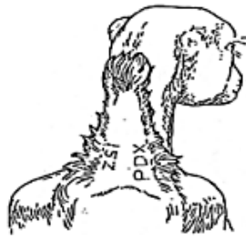
Traditional La Mancha Tail Web Tattoo (R – PDX L- 15Z) Must be read left to Right as it appears on the form. Note: PDX 15Z is not the same as 15Z PDX