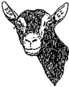
Right Ear: Herd letters Left Ear: Number & Year