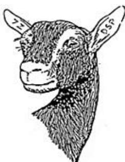
Tattoos are switched. Herd letters in left ear, number and year letter in right ear. This is acceptable if so recorded on the registration paper. (R-7Z L-DSP)

These would invalidate a show win unless the problem was noted on the registration papers officially by CLRC.