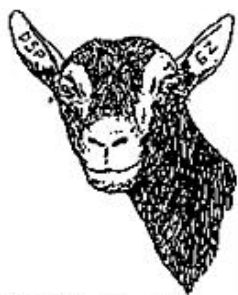
Right Ear: Herd letters Left Ear: Number & Year